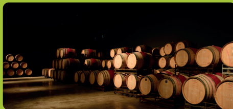
Torres Priorat. DOQ Priorat