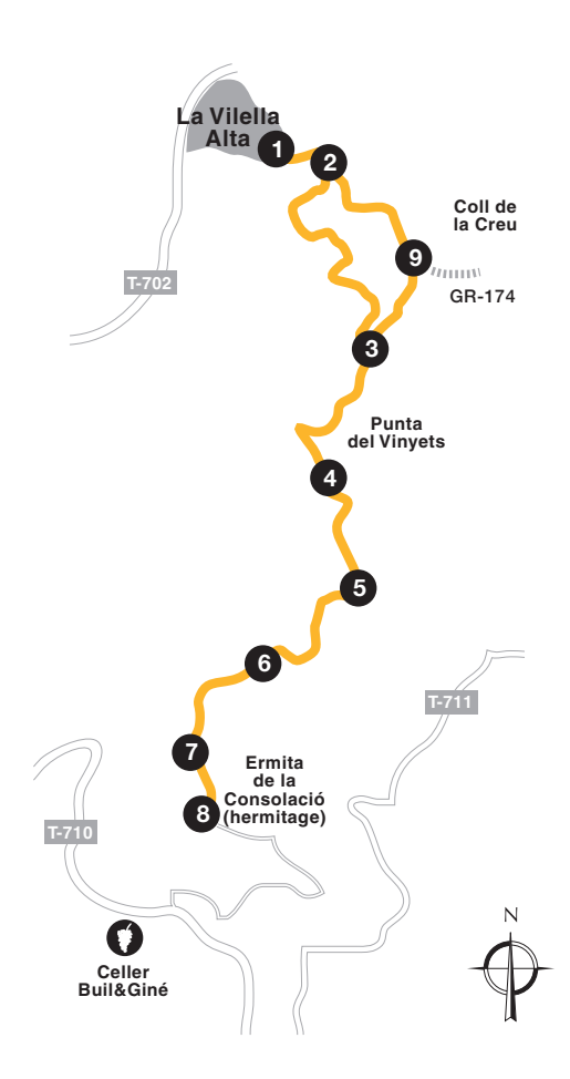
The paths of the Priorat Hiking Paths Network are marked with painted yellow waymarkers except for those which coincide with parts of GR (European Hiking Network Long Trails) or PR (Short Trails). On these paths, the FEEC (Catalan Rambling Club Federation) waymarkers are used

your right first and then climbing straight up towards the entrance 8 . A hermit who loves her solitude lives here. There is a sign which says: "...place of peace, prayer and serenity. Please respect the peace and silence. Thank you". We re-trace our footsteps until we reach the path which leads up to the Coll de la Creu 3 . We turn right, climbing slightly until we reach the peak 9 where we join the GR 174 (European Hiking Network Long Trail). The path continues straight downwards until it reaches the first few houses of the village.