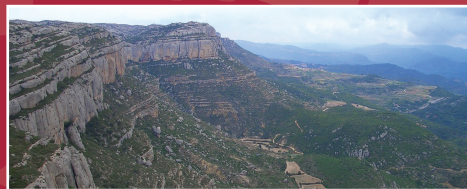
Cliffs of Scala Dei. Eva Civiell.

TOTAL DISTANCE: 6.3 km TOTAL TIME: 2 h (rest stops not included) LEVEL OF DIFFICULTY: LOW TOTAL ASCENT: 240 m