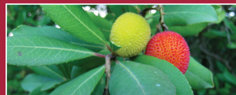
Strawberry tree ( Arbutus unedo ). Roger Pascual.

Cartoixa d'Scala Dei [10.1]: Created in the year 1194, this was the first Carthusian monastery in the Iberian Peninsula. A centre of culture, art and spirituality, it was notable for its prosperity and riches. Finally, however, it felt the consequences of the disentanglement acts passed by the liberal governments of the 19th Century and the popular antiderical movements that led to the exclausturation of the monks and the dispersal and, in part, the disappearance of the artistic and cultural heritage, and the destruction of the monastery. La Pietat [10.2]: This was a large estate built in the 17th Century by order of the prior as a place of rest for the bishops of Catalonia. Mas de Sant Antoni [10.3]: Situated where the settlement of Montalt used to be. Abandoned in 1285 as a result of the incentives offered by the Carthusian monks to its inhabitants. The church was converted into what is today the chapel, now in ruins. Font Pregona [10.4]: According to tradition, this spring never runs out. Today it supplies the village of Scala Dei with water.