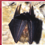
Lesser horseshoe bat ( Rhinolophus hipposideros ), in the Cova de la Taverna.