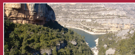
Final part of Barranc de la Taverna. Joan Ferran.

Margalef de Montsant (378 m high) is located at the bottom of the valley of Montsant river and is embedded in a cliff that forms one of the sides of the street. The main economic activity is to cultivate olive trees and sweet fruit. Church of Sant Miquel: 18th century church which is stuck to the rock. Chapel of Sant Salvador: Built in the 16th century in a shelter cave in a magnificent natural landscape. Cova de la Taverna [3.1]: This cave is located at the bottom of a ravine with the same name. It has a geological, botanical, zoological and archaeological interest. La Cogulla (1.063 m) [3.3]: It is the highest point of this part of the mountain range and it was the setting of a bloody battle in 1939. This spot offers magnificent views.